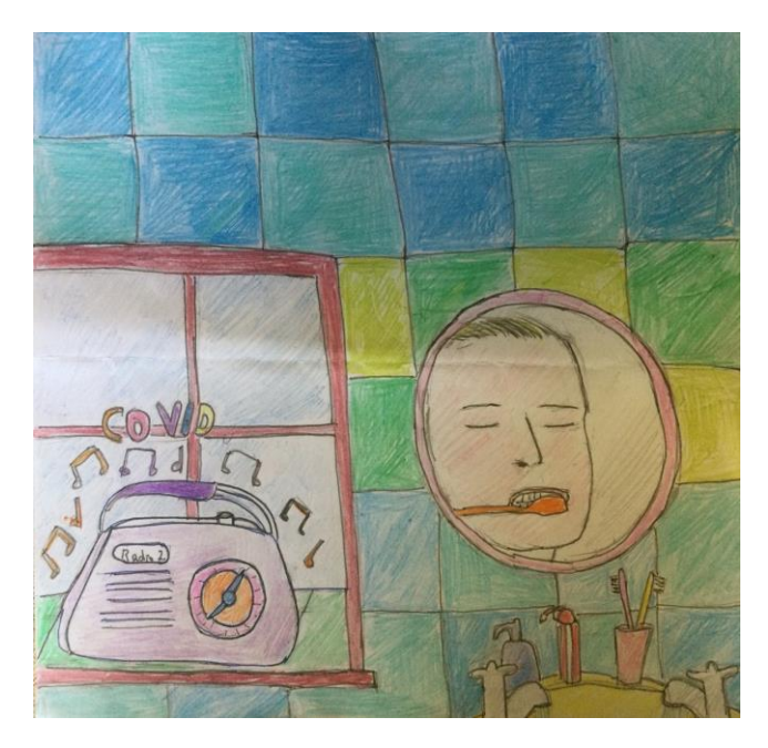
Corona-quilt, (everyday rituals), Matt. Pencil crayon

within communities experiencing complex social issues to support vulnerable people when they were needed most.