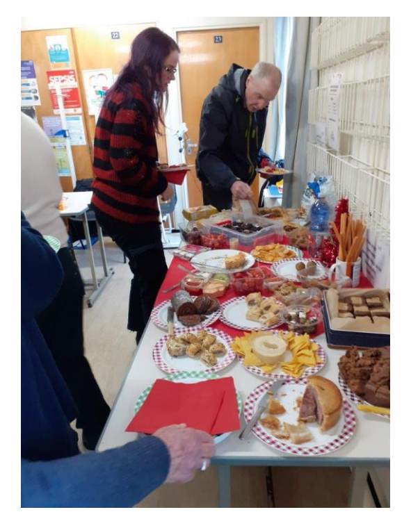
Bring and share Christmas lunch at LHC