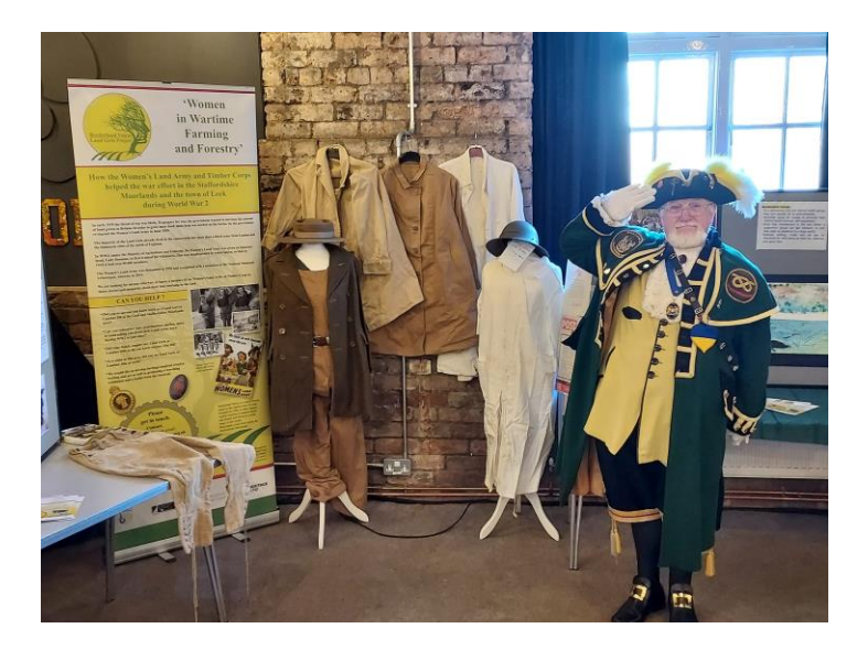
WLA display, Writing Leek event

Two edited extracts offer some context. The first is from a research digest commissioned by the Lloyds