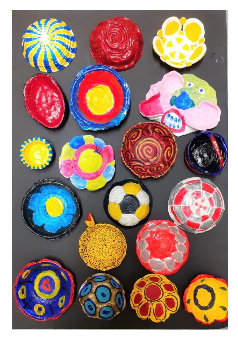
Coil pots, made with placement student Jess