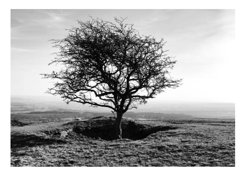
Solitary tree, Mark. Photograph

Non-medical referrals such as befriending services, practical information including benefits and financial advice, community activities , arts and culture and physical activities, and those that take place in nature can alleviate issues relating to loneliness, stress, mild to moderate depression, and anxiety .