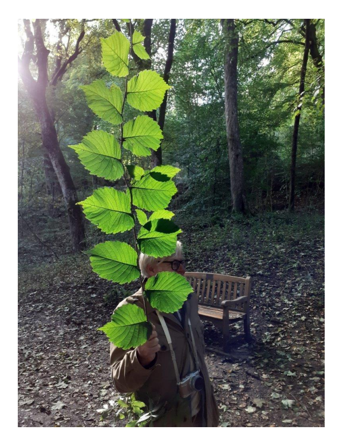
Grin Low Woods visit

Becca's remaining art packs included: contributing to an online 'Corona-quilt' (theme – rituals of everyday); 'Steal their style' (Salomon, Kahlo, Hockney, Warhol, Miro, Dali); Historic buildings; Rousseau's jungle artwork; and Klimt/Art Nouveau. Since September we've tackled Trees, inspired by a