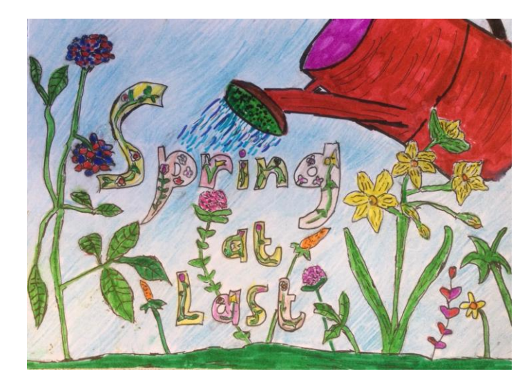
'Spring at last', Matt. Felt-tip pen

Kniveden, SIL and self-referrals, and the welcome return of familiar faces, both writing and art groups are often at capacity. Indeed, if everyone 'on the books' turned up, finding enough space would be difficult. The existence of a waiting list just underlines the vital service BV provides locally to support mental well-being.