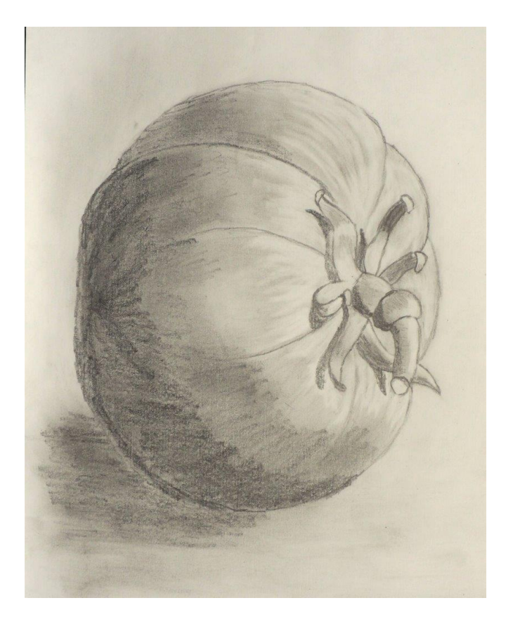
Crop study, Will. Pencil