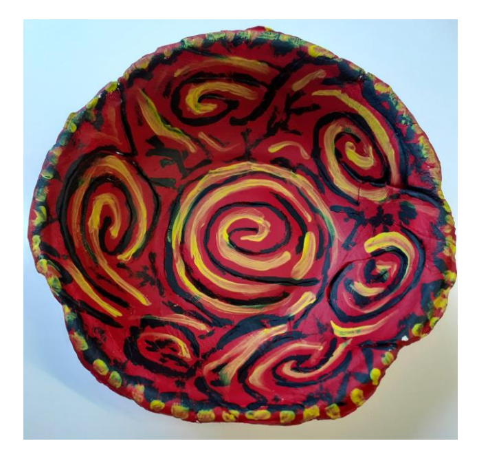
Coil pot, Tia

I take the steps, trusting these new words, reaching closer to the top. The nasty evil thoughts that cloud this place begin to whirl around,