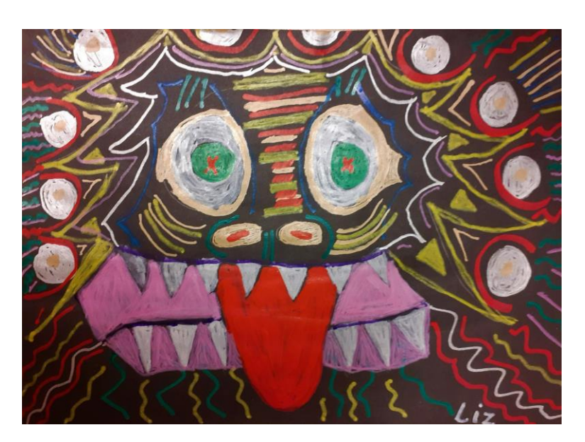
Chinese New Year, Liz. Mixed media

1. Weekly creative writing and art sessions.